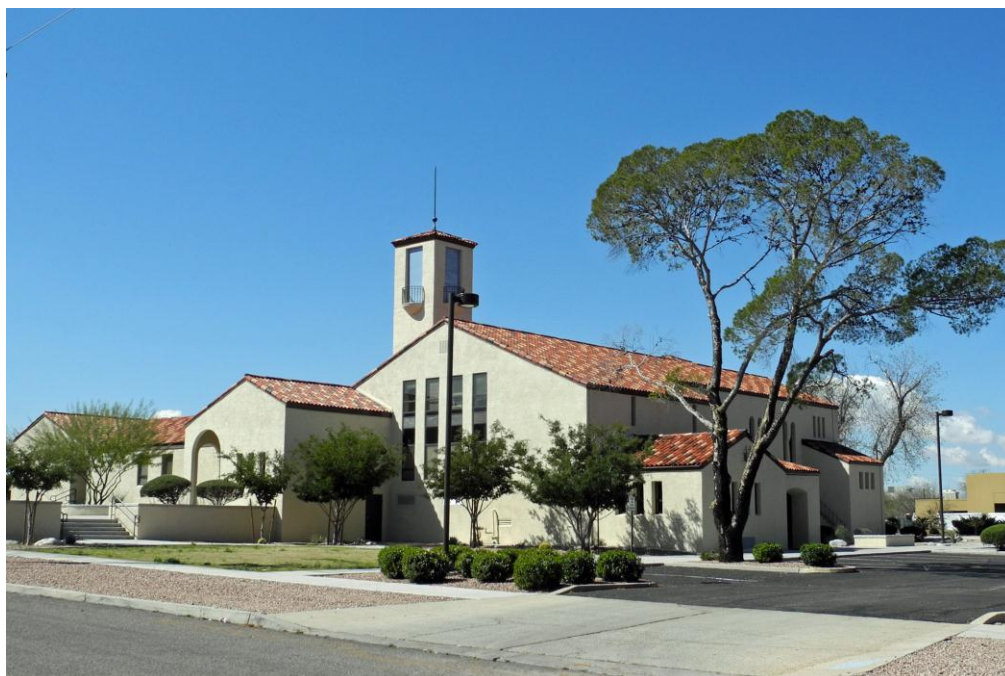
This Mormon Church at 3750 East Fort Lowell Road was dedicated in 1935 by Binghamton residents.