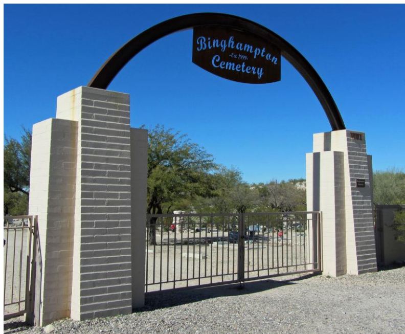
The Binghampton Cemetery, started in 1899, still accepts Mormons and their extended families for burial.