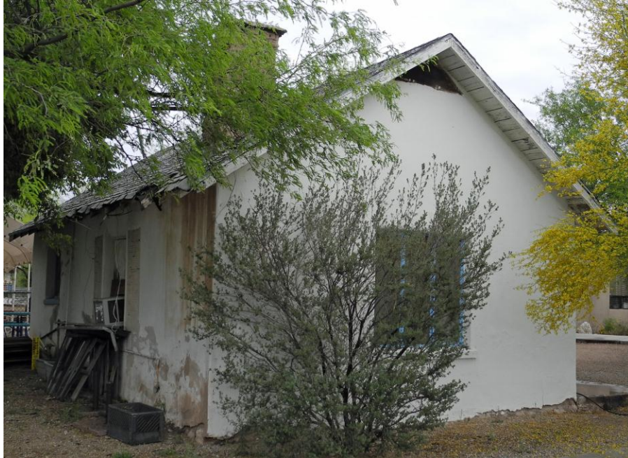
This original Binghampton school building at 3701 East River Road is now part of Khalsa Montessori School.